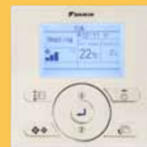
Wired remote control BRC1E51A (optional)