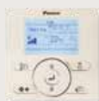
Wired remote control BRC1E51A