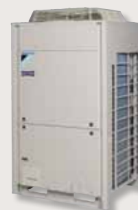
Outdoor unit RZQ200-250CY