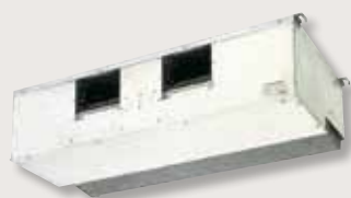
Indoor unit FDQ200-250B